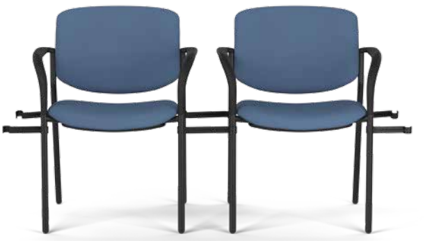
MODEL: 4-Leg with Glides TEXTILES: Momentum Silica Regatta FRAME: Black