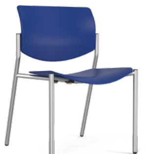
MODEL: 4-Leg with Glides PLASTIC: Blue FRAME: Silver