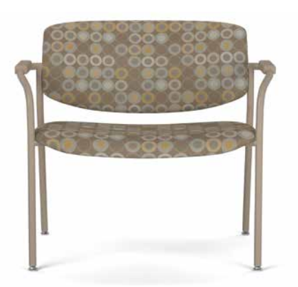
MODEL: 30" Bariatric 4-Leg with Glides TEXTILES: Arc Com Yoyo Stone FRAME: Bisque

Freelance bariatric chairs offer both comfort and dignity to plus-size patients. Although the 30" and 42" wide seats have a weight capacity of 500 lbs. and 1,000 lbs., respectively, they look identical to the standard upholstered models so users won't feel singled out. And the 19" seat height and sturdy, pinch-proof arms are ideal for transitioning to/from a wheelchair. The Freelance Heavy Duty option is rated up to 350 pounds, ideal for either bariatric or 24/7 use.