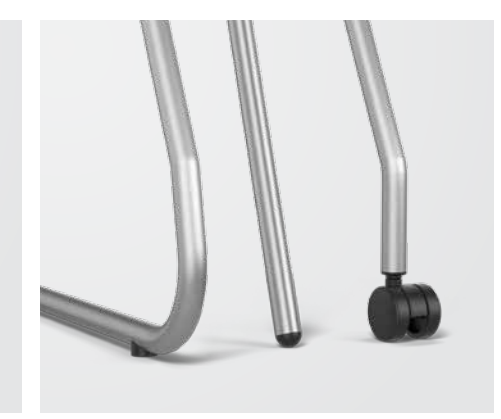
Book Rack Stacking Cart Glide (for sled base), Glide, Caster

Glide options: swivel, Floor Saver and plush carpet/tile. Caster options: carpet and hard floor.