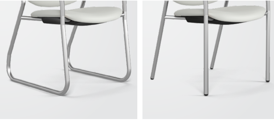
Sled Base 4-Leg