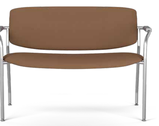
MODEL: 42" Bariatric 4-Leg with Glides TEXTILES: SitOnlt Collection Sugar Toffee FRAME: Silver